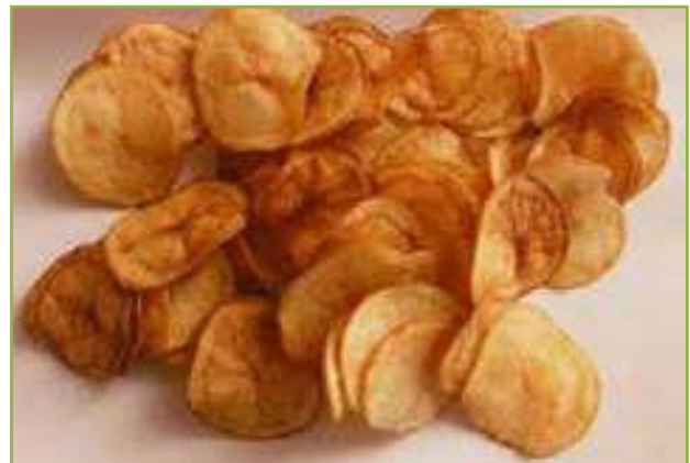
Crisps made from tubers containing a high concentration of reducing sugar.

In order to limit the formation of reducing sugars, the optimal temperature during tuber growth is between 15^{\circ}\text{C} and 25^{\circ}\text{C} . High levels of nitrogen during tuber growth are also associated with a high concentration of reducing sugars. Increasing the level of fertilisation with potassium, however, can reverse this effect, with sufficient potassium being deemed essential in optimising the percentage of dry material as well as the reducing sugar concentration, in processing cultivars.