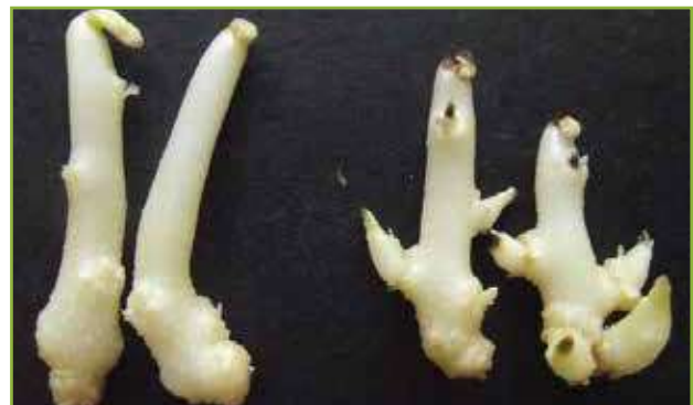
Sprouts (left) showing apical dominance and sprouts (right) forming lateral branches

physiologically old seed potatoes (sprouts right in photo), such branches tend to form haulms with poor vigour.