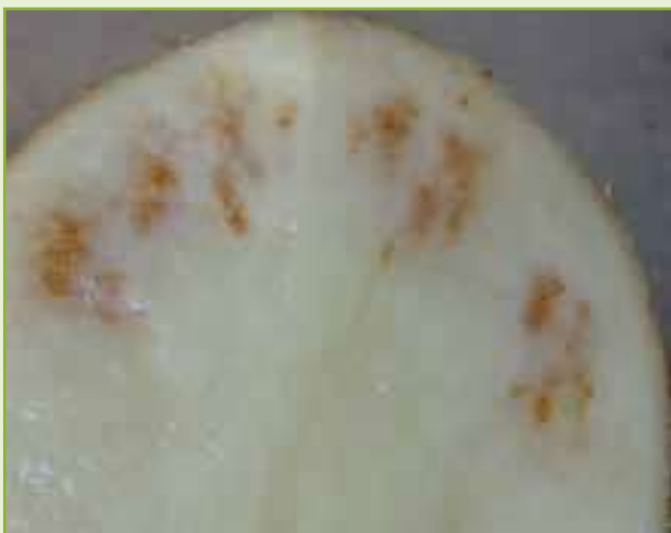
Internal brown spot

Plants cultivated in sandy soil are susceptible to brown spot, since the water retention capacity of sandy soil is low and the soil temperature tends to rise rapidly. On the other hand, an oxygen shortage under waterlogged conditions could prevent the absorption of water and Ca. Heavy soil tends to become waterlogged during the rainy season and with excess irrigation.