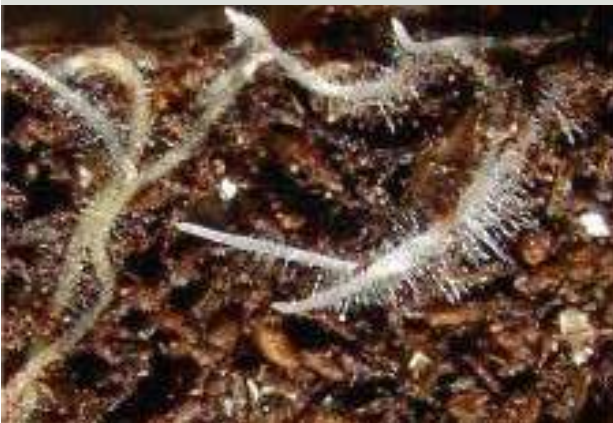
Delicate root hairs on root tips

Number of root hairs. Ca is absorbed through the unthickened cell walls of the root hairs. Root hairs are delicate extensions of the epidermal cells on the tips of the roots. When the soil dries out, so too do the root hairs and they subsequently die. Once moisture conditions have been restored, it takes approximately four days before new root hairs are formed. Relative to other crops, potatoes form few root hairs and this is a cultivar related characteristic. It is therefore important that soil moisture does not drop too low, especially during tuber formation.