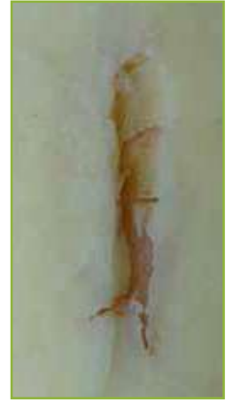
Transversal hollow heart