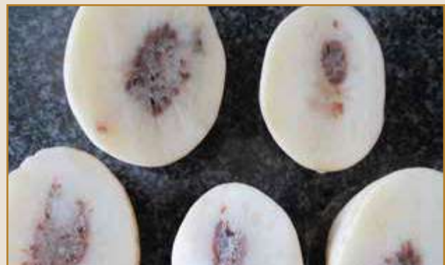
Hollow heart that was preceded by brown core