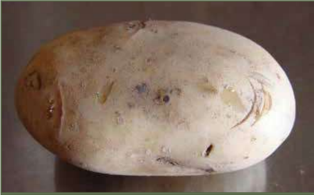
Thumb nail cracks