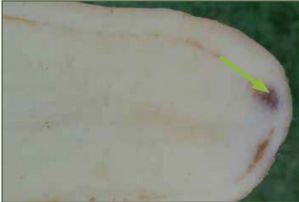
Tubers showing vascular browning. Note necrotic tissue near stolon end.