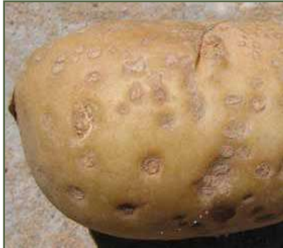
Enlarged lenticells that dried-out