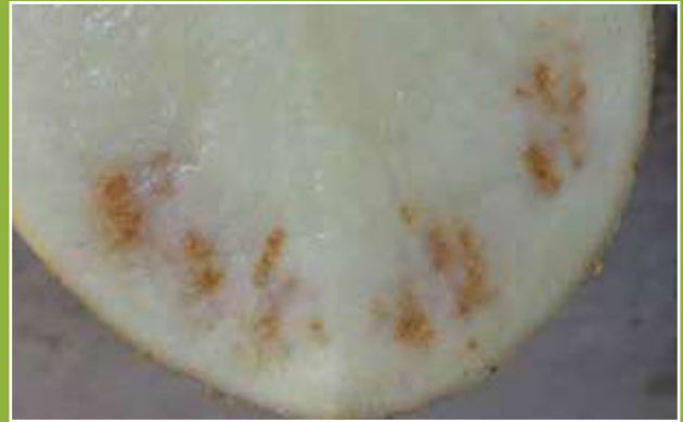
Brown fleck near the apical end of large tubers