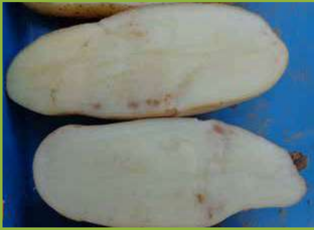
Brown fleck occurring in vascular bundle