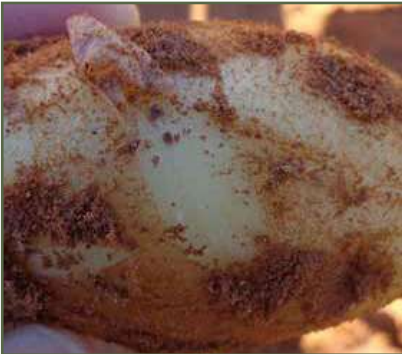
The skin of immature tubers is easily removed