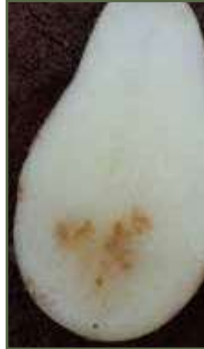
Internal brown fleck