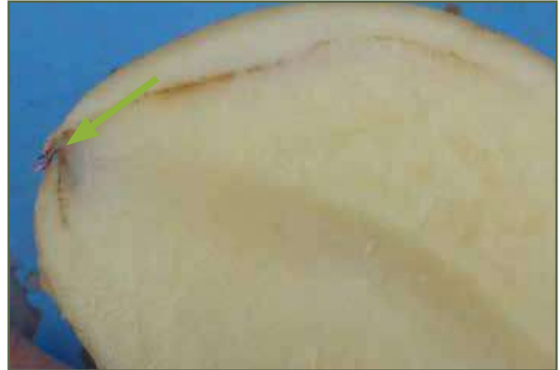
Vascular browning that originated from the stolon end.