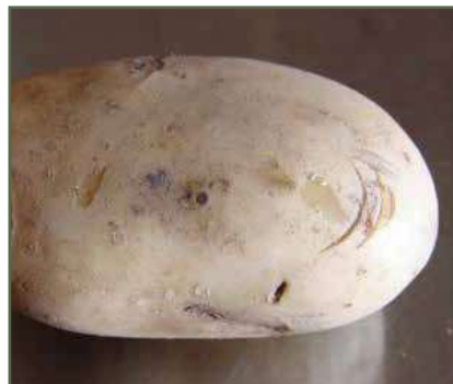
Thumb nail crack