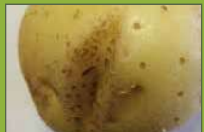
Cracks caused by Streptomyces (left) and Rhizoctonia (right)