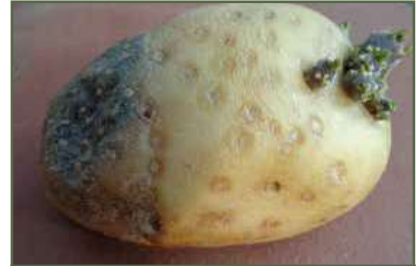
Symptoms of soft rot pathogens that entered the tuber through enlarged lenticells