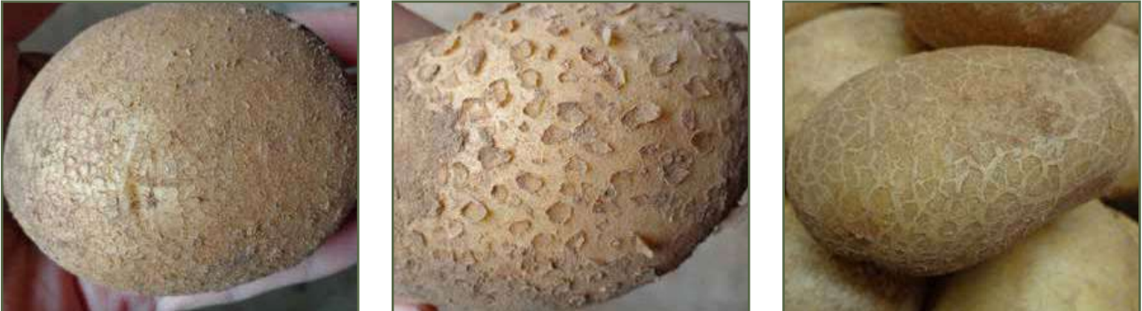
Tubers showing different degrees of netting