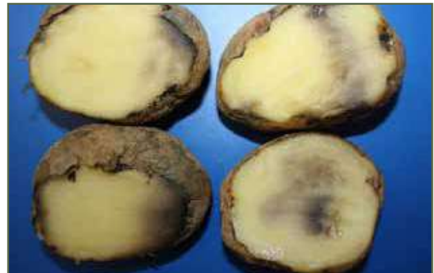
Tubers showing symptoms of cold damage