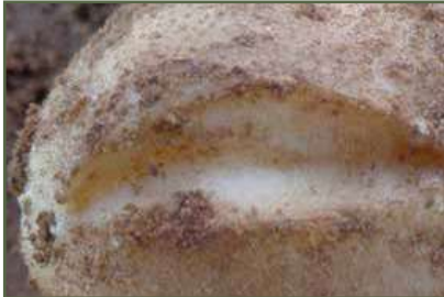
Growth cracks showing exposed tuber tissue