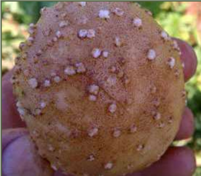
Tuber showing white callus-like growths