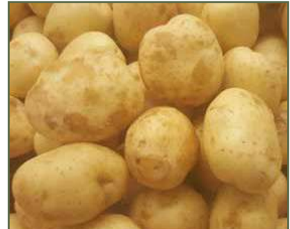
Tubers showing loose skin and browning