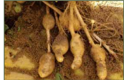
Tubers in chain form on a single tuber.