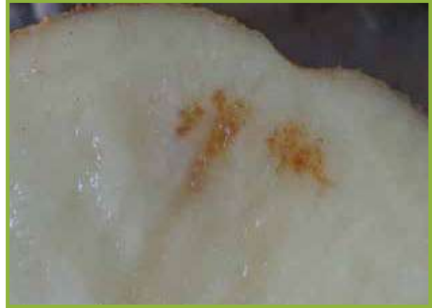
Close-up view of brown fleck