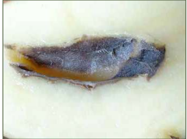
Black heart developed into a cavity. The tissue lining the cavity is leathery or hard.