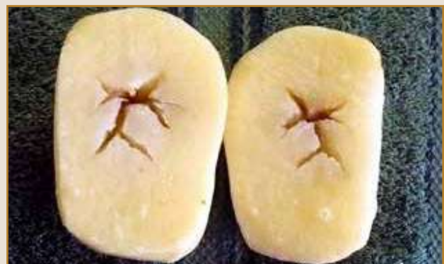
Hollow heart with irregular shape