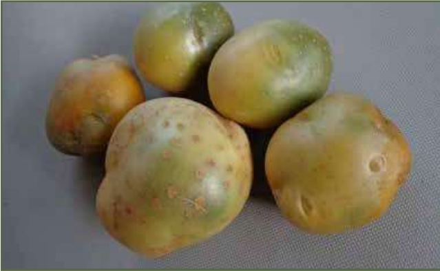
Tubers showing vascular browning. Note necrotic tissue near stolon end.