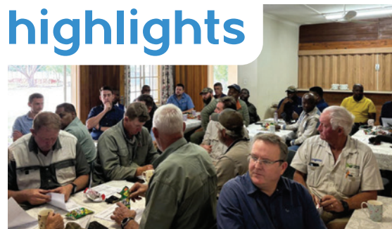
The Weenen regional meeting was well attended by producers and market agents.

Producers were generally optimistic about this season. A key issue identified was a shortage of certain cultivars' seed. It was agreed that marketing within the potato industry should be increased. Producers in some areas of KwaZulu-Natal were planting later because of concerns over another cold spell. The hectares planted this winter were slightly more