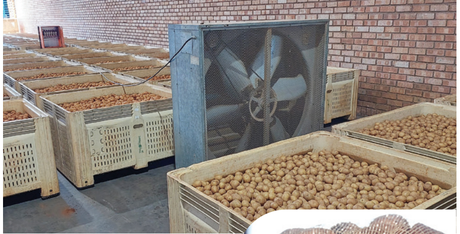
Aartappelmoere word opgewarm met uitlaai.

Abrie van Schalkwyk, die produksiebestuurder, oorsien die proses van opwarming van die aartappelmoere met uitlaai uit koelopberging. Hierdie proses is deur die jare tot in die kleinste besonderhede verfyn ten einde die beste gehalte aartappelmoer te kan sertifiseer. In reaksie op 'n vraag oor die gebruik van optiese kameras,