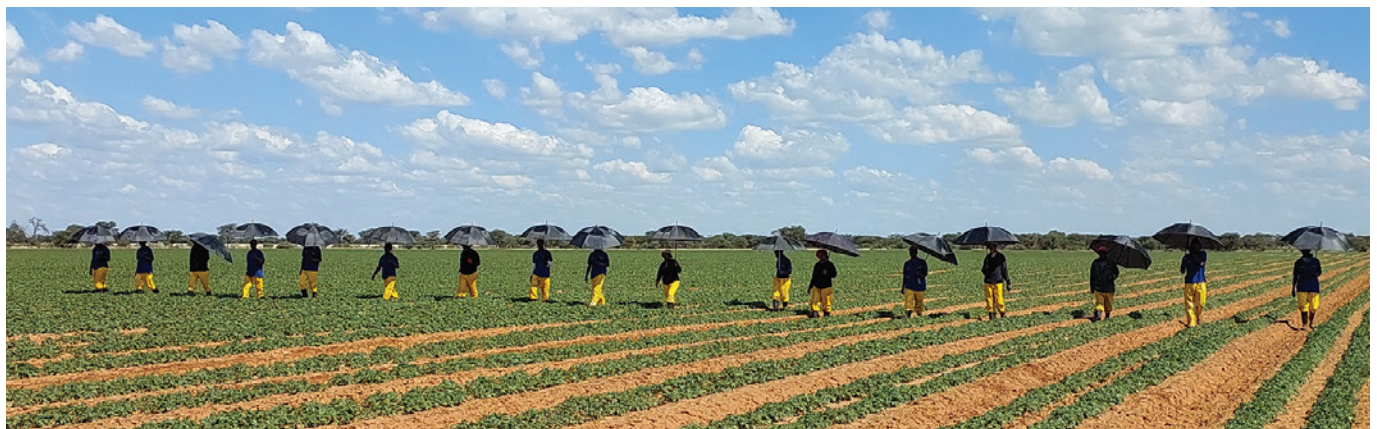
Carbrecht's roguing team ensures that any diseased plant or off-type is removed throughout the season.