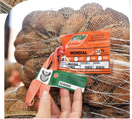
Elite gesertifiseerde G4-aartappelmoere

Ek glo 'n deel van Sirkel-N se sukses is dat hulle moere met uitlaai uit die koelkamer, in sakke verpak