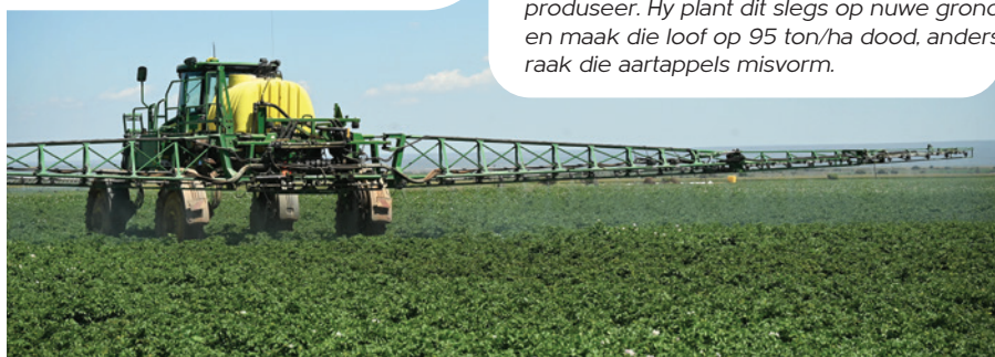
Gedurende die seisoen word bespuiting met 'n hoogloopspuit toegedien en Lutz Hellmuth van Henbrie Boerdery is self verantwoordelik vir die uitmeet van die chemiese middels.