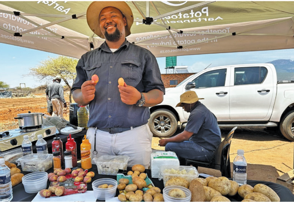
Potatoes SA's transformation team conducted a cooking show during which various cultivars were tested for taste and other quality aspects.

which various cultivars were fried and boiled to demonstrate the characteristics of table and processing potatoes. The harvest