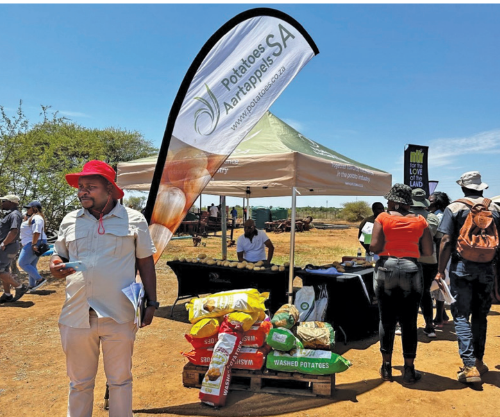
Potato production has great significance in the rural areas of the Capricorn district, serving as a testimony to the deep-rooted connections between industry role-players and the community. Harvest days bring together industry role-players as well as local potato producers.